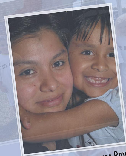
The YWCA Women's Resource Program assisted 47 women in removing barriers to education and employment.