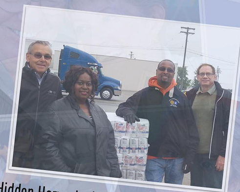
Hidden Harvest will distribute over $900,000 in food to Bay County agencies this year!